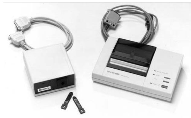
Data Keys with PC interface box and standard thermal printer