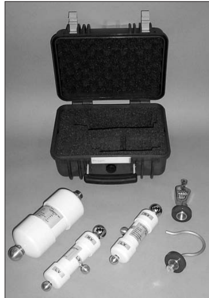
Optional capacitor kit includes carry case, TTR capacitor (left), and 2 reference capacitors (center). Also shown are 2 connectors (right) that will work with the capacitors and are supplied with the DELTA-2000 unit.