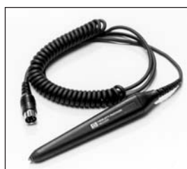
Optional bar code wand for recording an alphanumeric test identification