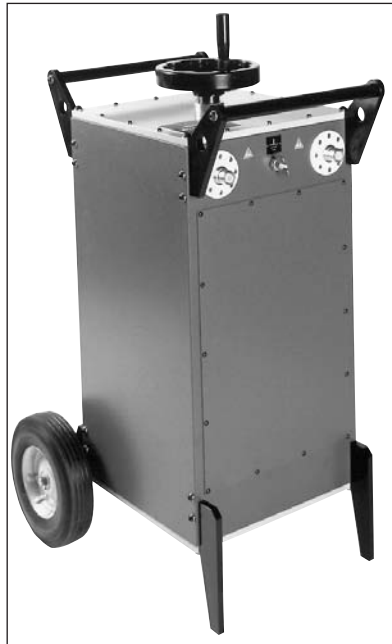
The optional Resonating Inductor expands the capacitance range of the DELTA-2000