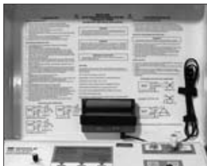
Optional printer mounted in lid