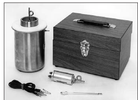
The optional Oil Test Cell is used for testing insulating fluids up to 10 kV