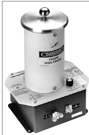
The optional Calibration Standard traceable to the NIST for quick operating or calibration checks of test set bridges calibrated in watts loss or in dissipation factor