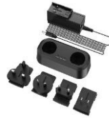
M Series Charging Base HM-5202ZC