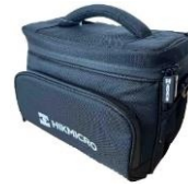
M/G/SP Series Pouch HM-SP01-POUCH

COMPLIANCE NOTICE: The thermal series products might be subject to export controls in various countries or regions, including without limitation, the United States, European Union, United Kingdom and/or other member countries of the Wassenaar Arrangement. Please consult your professional legal or compliance expert or local government authorities for any necessary export license requirements if you intend to transfer, export, re-export the thermal series products between different countries.