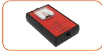
SPY® MODEL DCPJM DC POCKET JEEPMETER

Please call our office at (713) 681-5837 or email us at sales@spyinspect.com for more product details or to place an order.