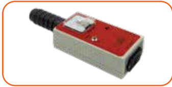
SPY® MODEL PJM POCKET JEEPMETER