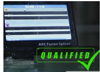
Stable splicing and low splicing loss