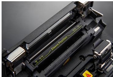
Inductive automatic heater No heating without fiber