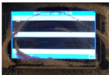
Working in dusty environment (Dust-proof)