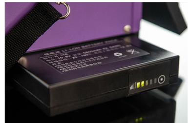
Long time working battery 250 cycles splice & heat